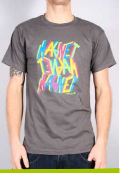
„ABYSS C.“ COLOR: CHARCOAL