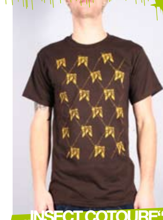
„INSECT COUTURE“ BROWN | BLACK | OLIVE | CHARCOAL GIRLS | BOYS | LONGSL. | TANKTOP