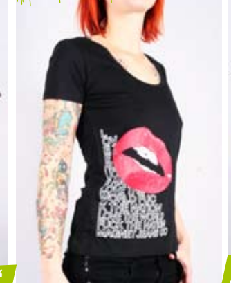
„RED LIPS“ BLACK | OLIVE | CHARCOAL GIRLS | BOYS | LONGSL. | TANKTOP