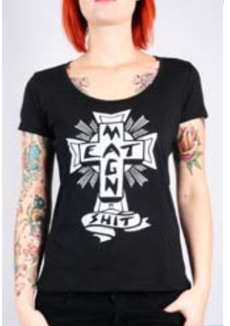
„EAT SHIT“ BLACK | OLIVE | CHARCOAL GIRLS | BOYS | LONGSL. | TANKTOP