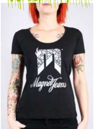
„MAGNET JEANS LOGO“ RED | GREEN | BLACK | OLIVE | CHARCOAL GIRLS | BOYS | LONGSL. | TANKTOP