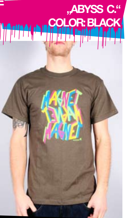
„ABYSS C.“ COLOR: BLACK