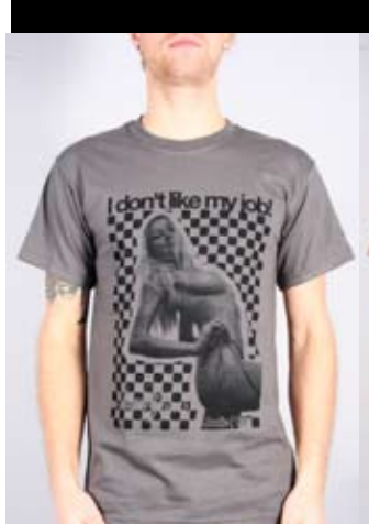
„JODY: I DON'T LIKE ...“