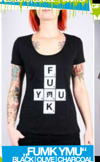
„FUNK YMU“ BLACK | OLIVE | CHARCOAL GIRLS | BOYS | LONGSL. | TANKTOP