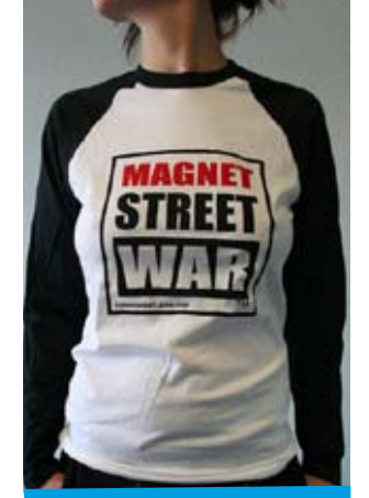
„MAGNET STREET WAR“