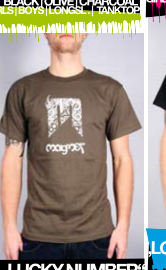
„LUCKY NUMBER“ BLACK | OLIVE | CHARCOAL GIRLS | BOYS | LONGSL. | TANKTOP