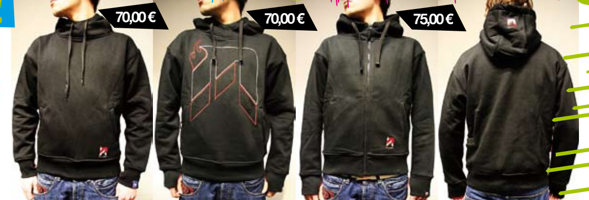
„MAGNET MINI LOGO HOODIE | LOGO HOODIE | MINI LOGO ZIPPER“ HOODED - SWEATSHIRT | HEAVY 400 GR. | 65% CN - 35% PY 2 POCKETS + PHONEPOCKET | SLEEVE - THUMBHOLES | DOUBLE LAYERED HOOD | TWIN SEAMS | EMBROIDERIES MEN SIZES: S | M | L | XL | XXL