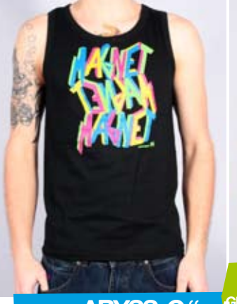
„ABYSS C.“ TANKTOP