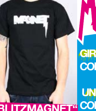
„BLITZMAGNET“ BLACK | OLIVE | CHARCOAL GIRLS | BOYS | LONGSLEEVE | TANKTOP