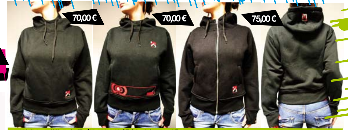
„MAGNET GIRLS MINI LOGO HOODIE | WORLD LOGO HOODIE | MINI LOGO ZIPPER“ HOODED - SWEATSHIRT | HEAVY 400 GR. | 65% CN - 35% PY 2 POCKETS + PHONEPOCKET | SLEEVE - THUMBHOLES | DOUBLE LAYERED HOOD | TWIN SEAMS | EMBROIDERIES SIZES: XS | S | M | L | XL

SIZES: 36 | 34 | 33 | 32 | 31 | 30 | 29 | 28