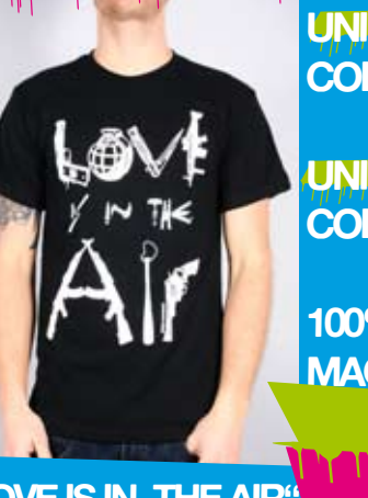
„LOVE IS IN THE AIR“