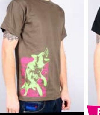
„GERMAN WOLF“ BLACK | OLIVE | CHARCOAL GIRLS | BOYS | LONGSLEEVE | TANKTOP