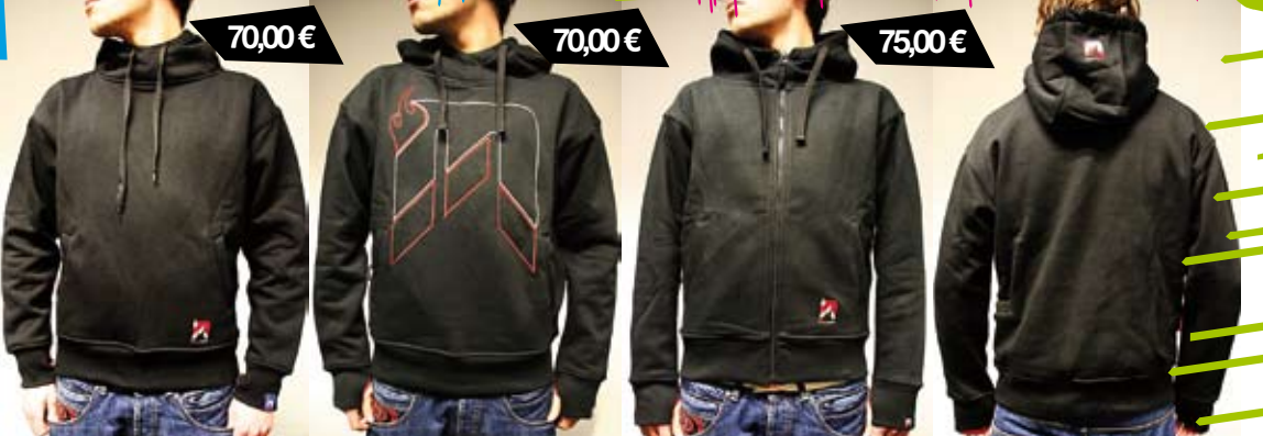
„MAGNET MINI LOGO HOODIE | LOGO HOODIE | MINI LOGO ZIPPER“ HOODED - SWEATSHIRT | HEAVY 400 GR. | 65% CN - 35% PY 2 POCKETS + PHONEPOCKET | SLEEVE - THUMBHOLES | DOUBLE LAYERED HOOD | TWIN SEAMS | EMBROIDERIES MEN SIZES: S | M | L | XL | XXL