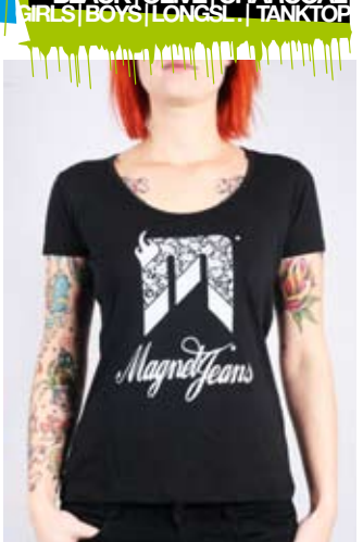
„MAGNET JEANS LOGO“ RED | GREEN | BLACK | OLIVE | CHARCOAL GIRLS | BOYS | LONGSLEEVE | TANKTOP