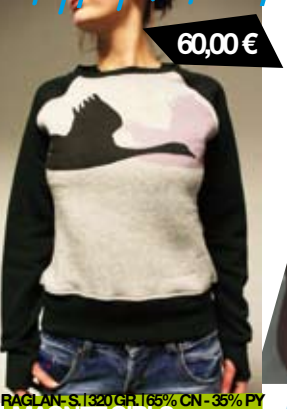
„MAGNET GIRLS CRANES SWEATSHIRT“ RAGLAN - S | 32 | 34 | 36 | 38 | 40 | 42 | 44 | 46 | 48 | 50 2 POCKETS + PHONEPOCKET | SLEEVE - THUMBHOLES | TWIN SEAMS LADIES SIZES: XS | S | M | L | XL