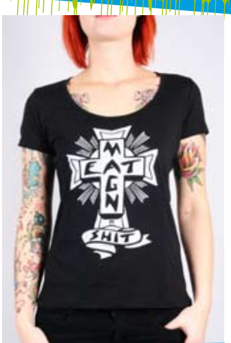
„EAT SHIT“ BLACK | OLIVE | CHARCOAL GIRLS | BOYS | LONGSLEEVE | TANKTOP