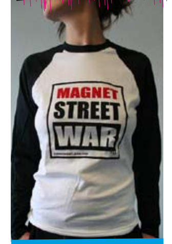
„MAGNET STREET WAR“