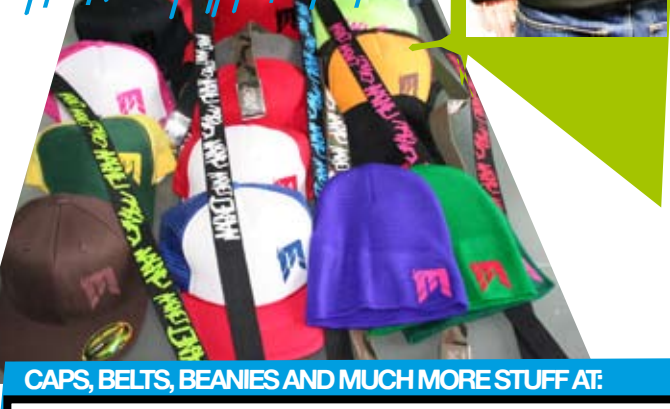
CAPS, BELTS, BEANIES AND MUCH MORE STUFF AT: