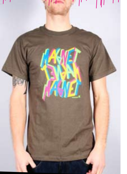
„ABYSS C.“ COLOR: OLIVE