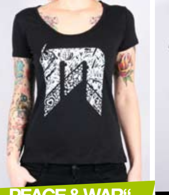
„PEACE & WAR“ BLACK | OLIVE | CHARCOAL GIRLS | BOYS | LONGSLEEVE | TANKTOP