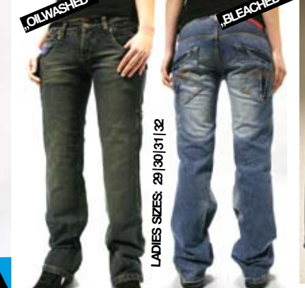
„MAGNET GIRLS DIRTY DOVE“ DENIM JEANS | 100% COTTON | 13 OZ. 7 POCKETS INCL. 2 BEERPOCKETS | „BOOT CUT“ | BUTTON FLY | LOGOPATCHES