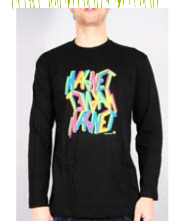
„ABYSS C.“ LONGSLEEVE