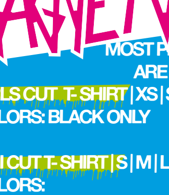
„MARY: I WANT TO ...“