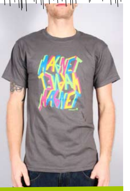
„ABYSS C.“ COLOR: CHARCOAL